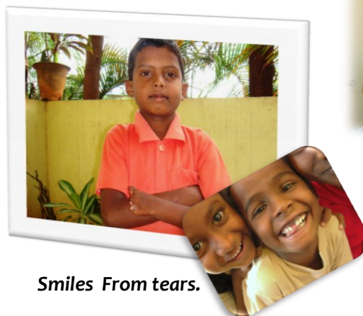
Smiles From tears.

"The City streets will be filled with Boys and Girls playing there" (Zechariah: 8:5)