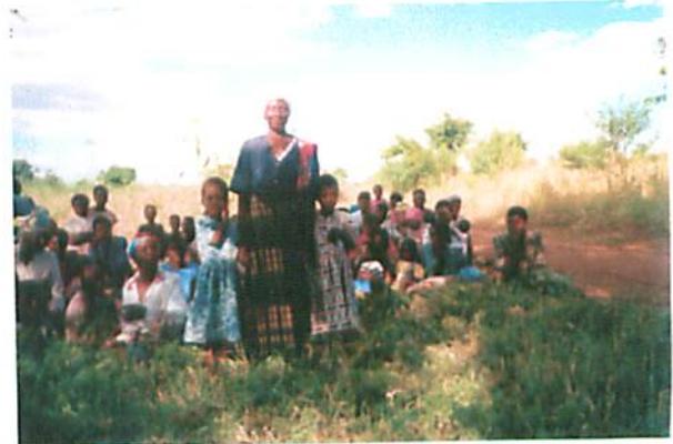
Galufu headwoman and orphans