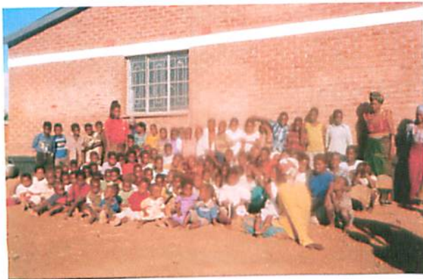
The Galufu orphans

I wonder whether we would be able to smile if we had so little.